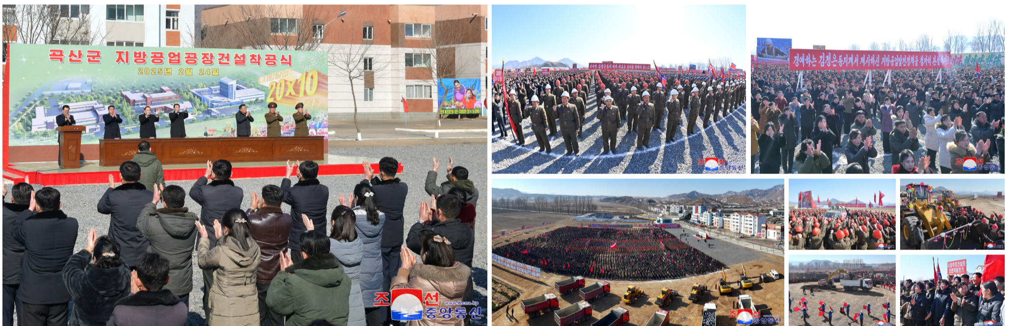
A groundbreaking ceremony of regional-industry factories takes place in Koksan County on February 24.

KCNA The grand construction struggle in 2025 to implement the regional development policy in the new era is going