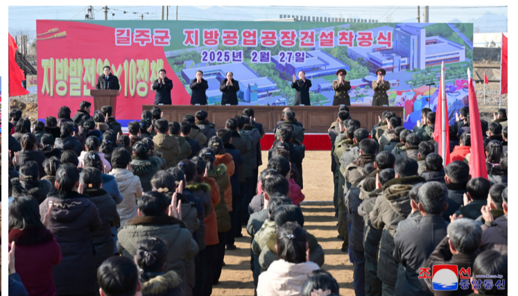
The construction of regional-industry factories begins in Pukchang and Kilju counties with groundbreaking ceremonies on February 27.