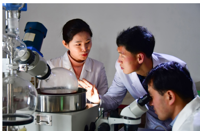
Researchers hold a discussion to develop a new Koryo medicine at the Pharmacology Institute of the Academy of Medical Science.

The Pharmacology Institute under the Academy of Medical Science directs efforts into research into the