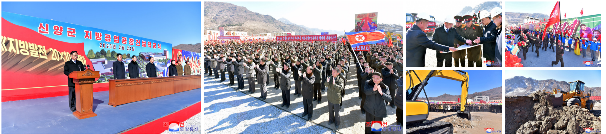
A groundbreaking ceremony is held for the construction of regional-industry factories in Sinyang County on February 24.

Groundbreaking ceremonies of regional-industry factories and public health, leisure and grain storage facilities are held in different parts of the country for implementing Regional Development 20x10 Policy