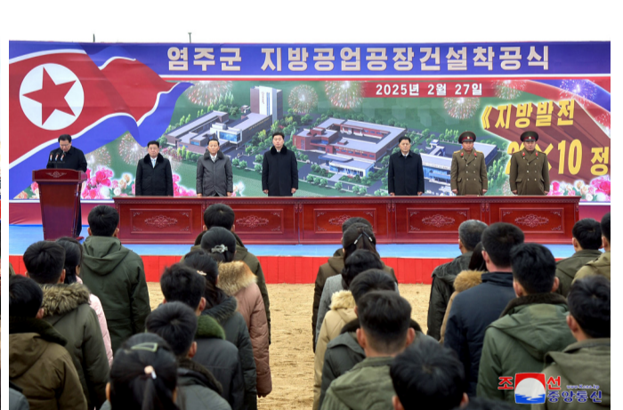
Groundbreaking ceremonies of regional-industry factories take place in Paechon and Yomju counties on February 27.