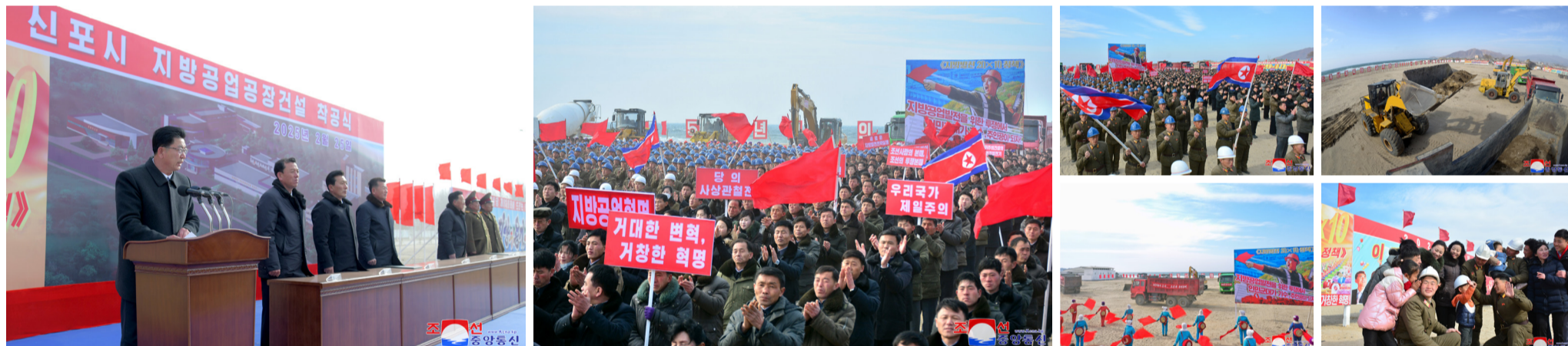
A ceremony is held for the construction of regional-industry factories in the city of Sinpho on February 25.