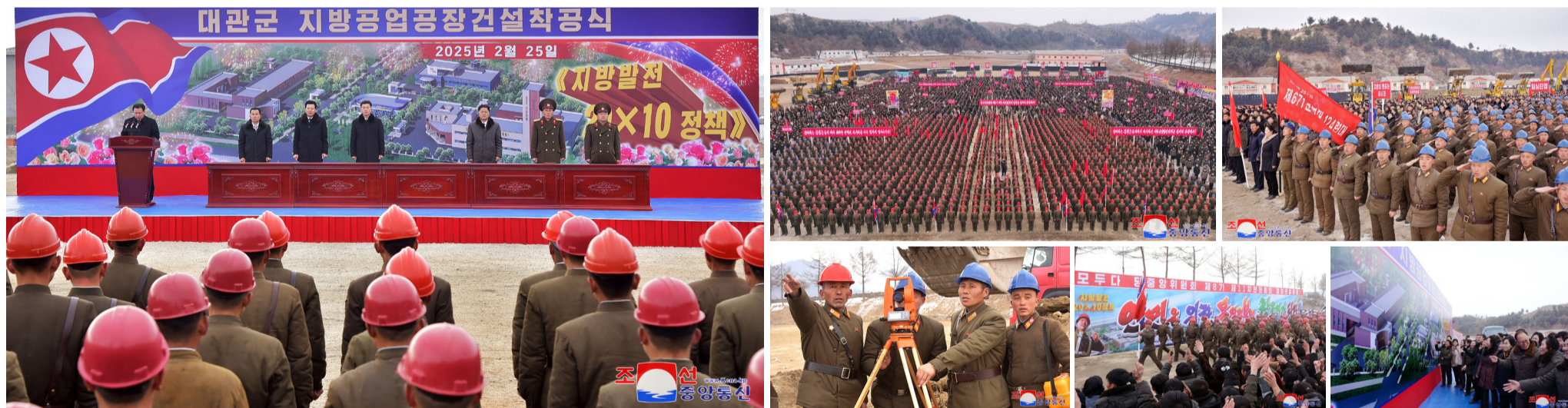
The construction of regional-industry factories begins with a groundbreaking ceremony in Taegwan County on February 25.