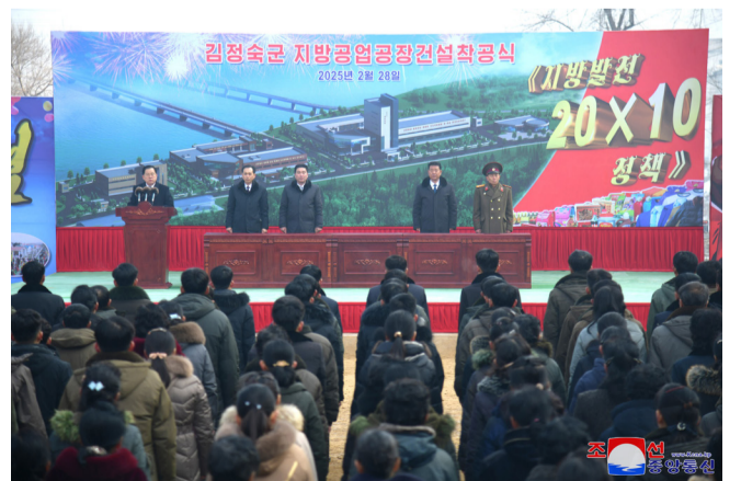
Ceremonies are held to start the construction of regional-industry factories in Jangyon, Kangdong and Kim Jong Suk counties on February 28.