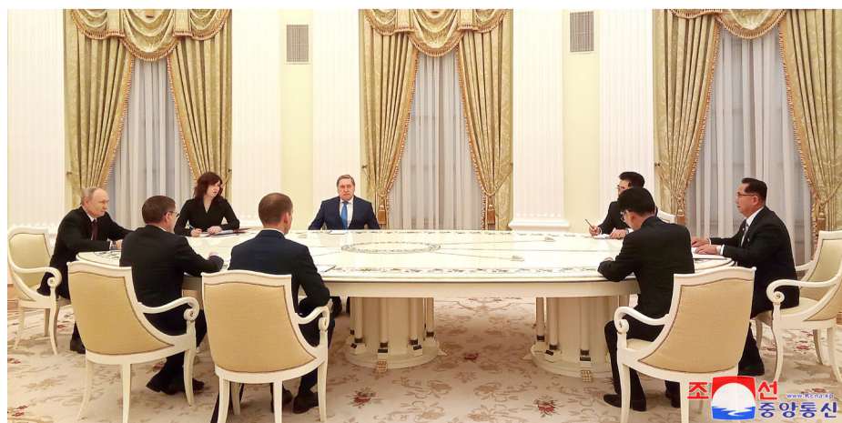
Ri Hi Yong, member of the Political Bureau and secretary of the Central Committee of the Workers' Party of Korea and chairman of the Central Inspection Commission of the WPK, meets with Russian President Vladimir Vladimirovich Putin in the Kremlin, Moscow, on February 27.