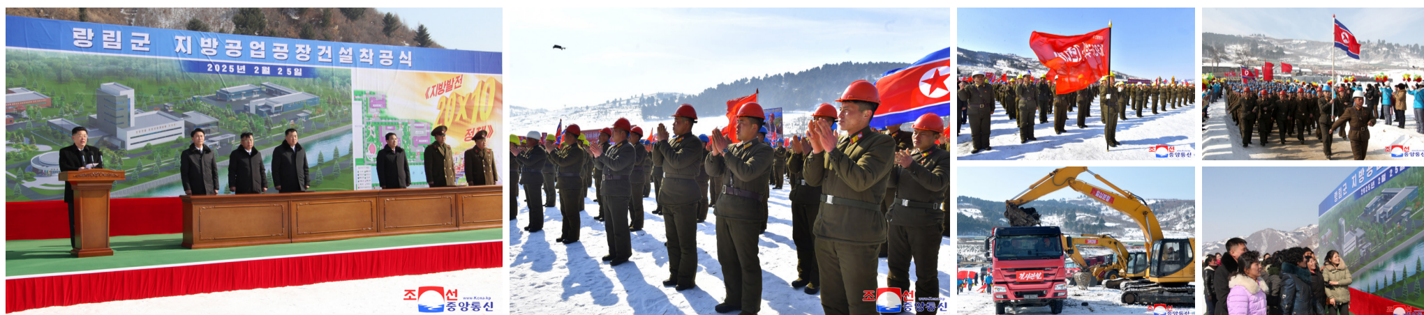
A groundbreaking ceremony of regional-industry factories takes place in Rangnim County on February 25.