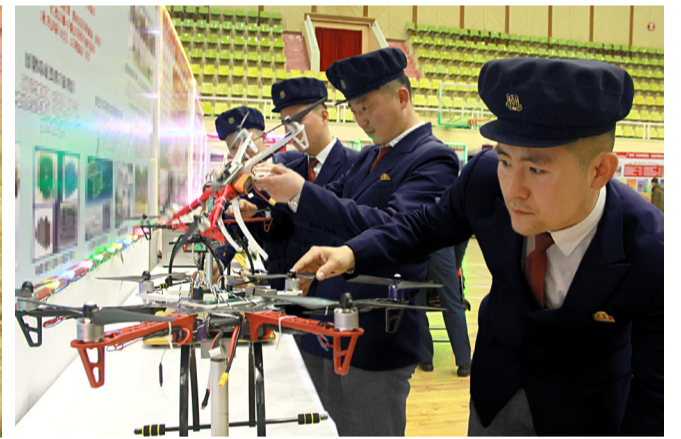
Visitors look round sci-tech achievements with keen interest.