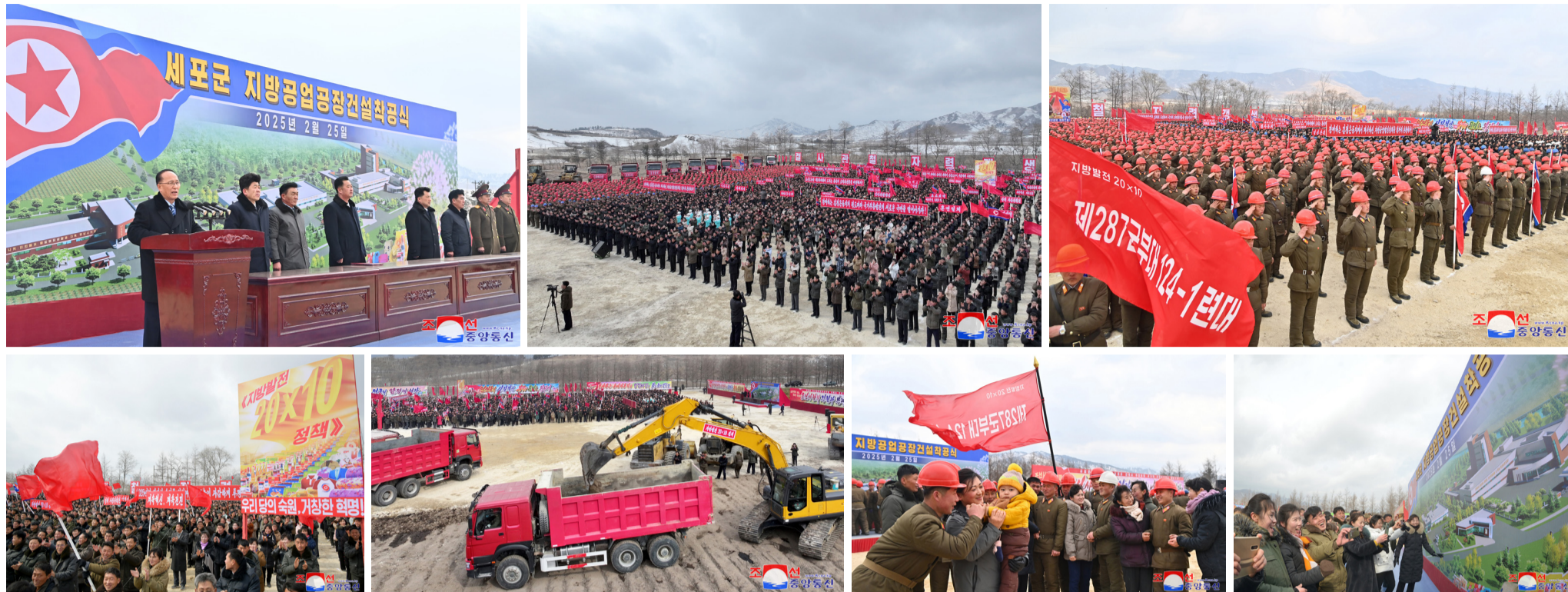
A groundbreaking ceremony of regional-industry factories is held in Sepho County on February 25.