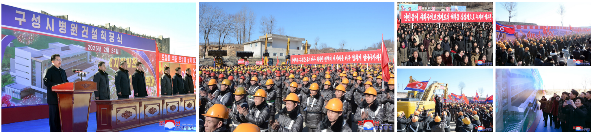
The construction of the Kusong City Hospital starts with due ceremony on February 24.

city and counties, service personnel and builders. At the ceremonies, speakers said that the stirring reality, SEE PAGE 12