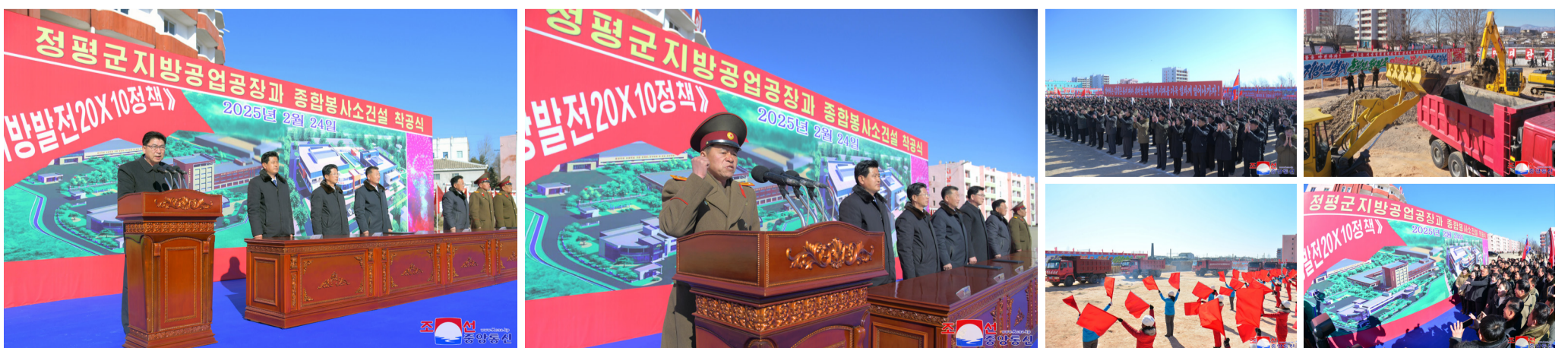
A groundbreaking of regional-industry factories and a leisure complex takes place in Jongphyong County on February 24.