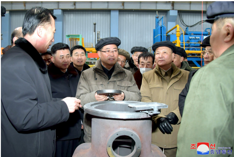
Premier Pak Thae Song (sixth from left) inspects the Ryongsong Machine Complex.

At the Ryongsong Machine Complex, a leading machine-building base of the country, the premier called upon its officials, technicians and workers to unconditionally attain the modernization goal set for this year, true to the intention of the Party to turn the complex into a model of the machine-building industry, and make fresh innovations in the production of major custom-built equipment by waging a dynamic drive for increased production as befitting the creator of the Chollima spirit in the new era.