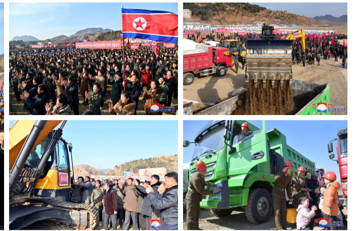
The construction of regional-industry factories starts in Cholwon County with a groundbreaking on February 27.