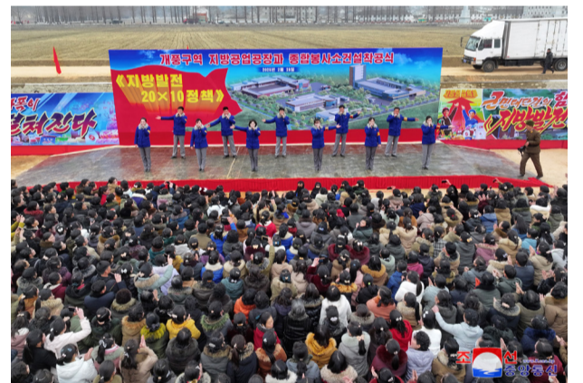
A groundbreaking of regional-industry factories and a leisure complex takes place in Kaepung District on February 28.