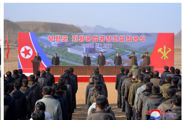
Groundbreaking ceremonies of the Unsan Paper Mill and regional-industry factories of Puryong County are held on February 28.