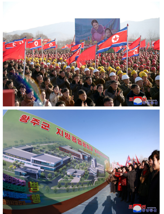
A ceremony is held to start the construction of regional-industry factories and a grain storage station in Hwangju County on February 26.